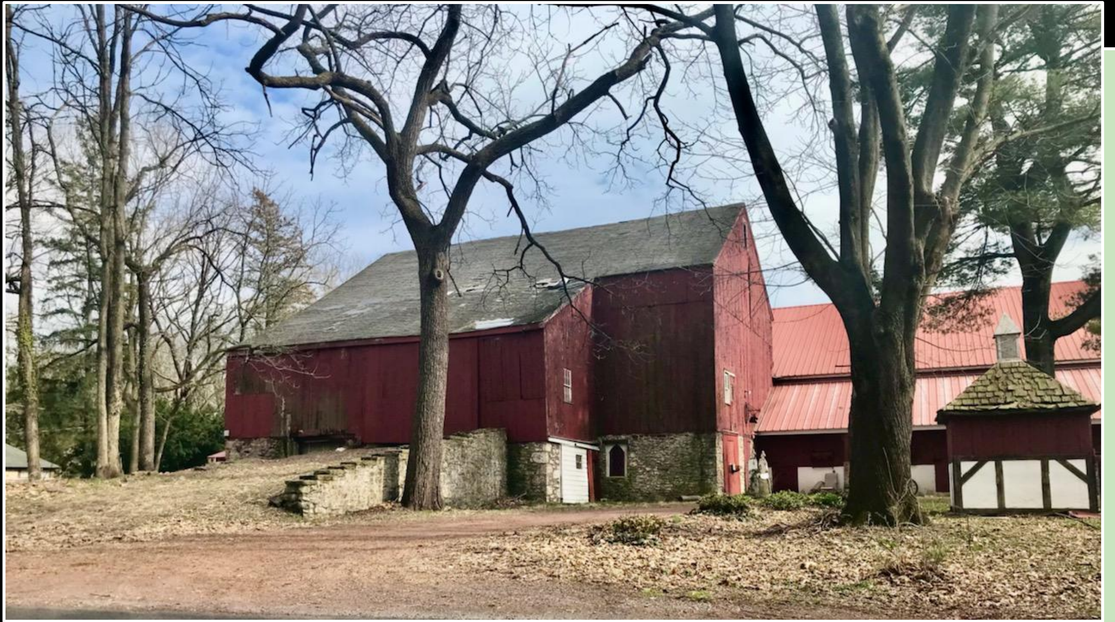
The McCook Barn