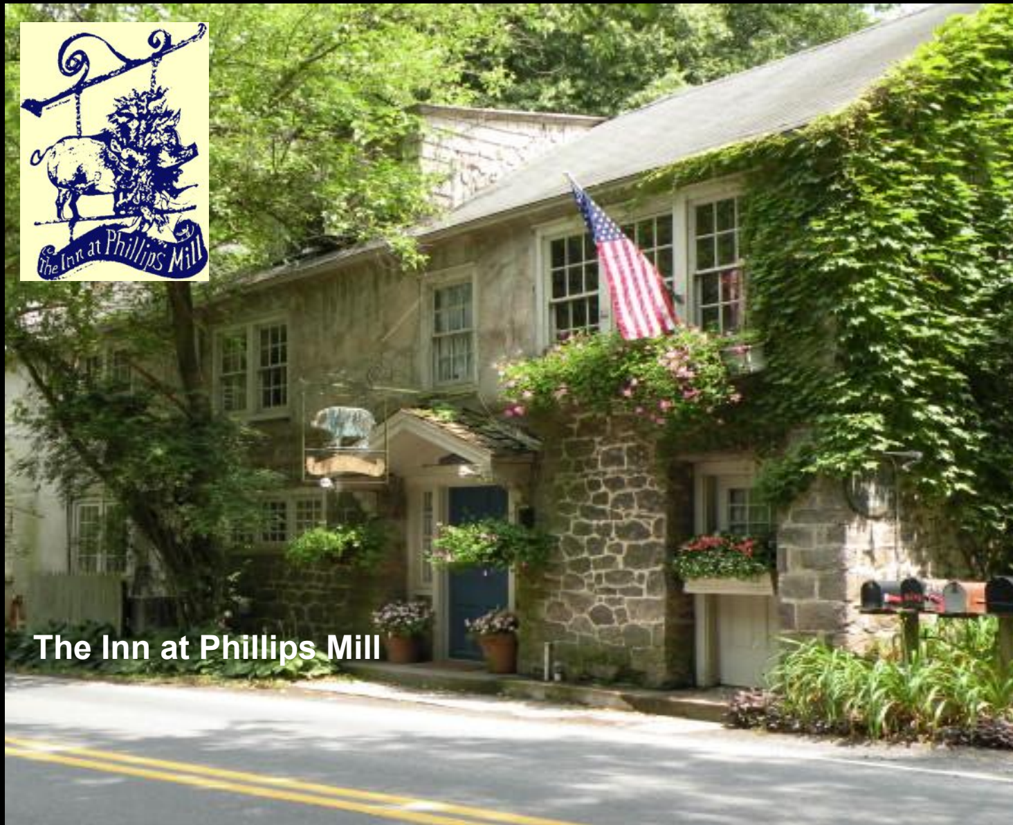
The Inn at Phillips Mill