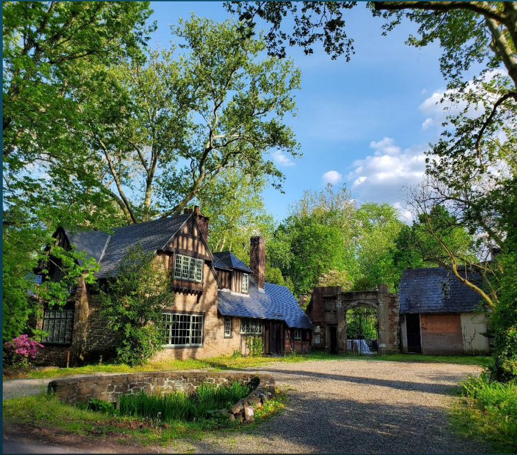
1) Morgan Colt Main House