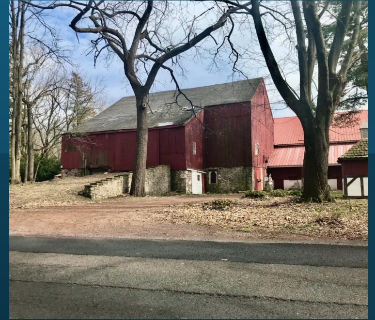
3) West End Farm