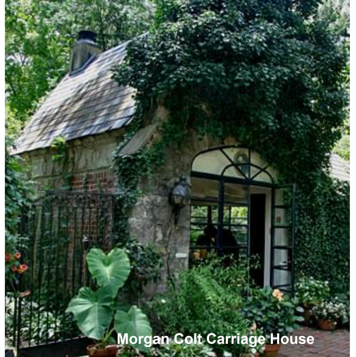
Morgan Colt Carriage House