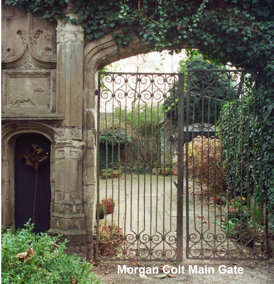
Morgan Colt Main Gate