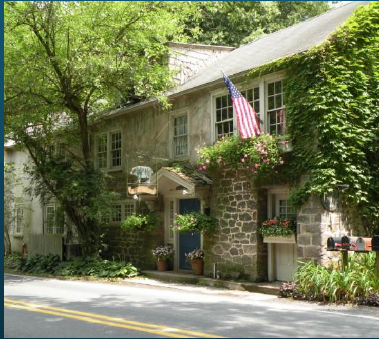
2) The Inn at Phillips Mill