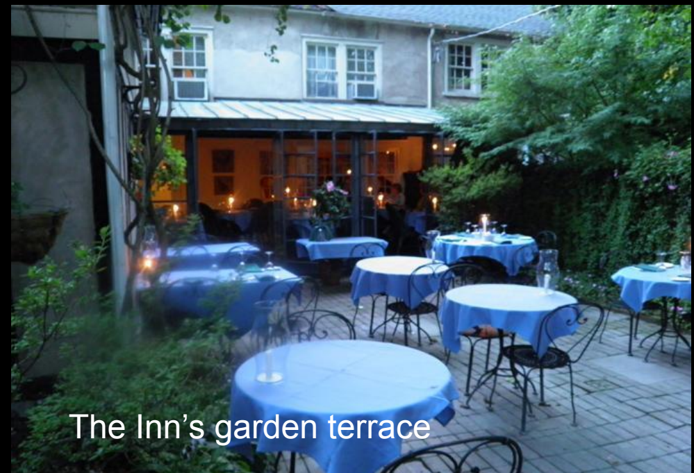
The Inn's garden terrace