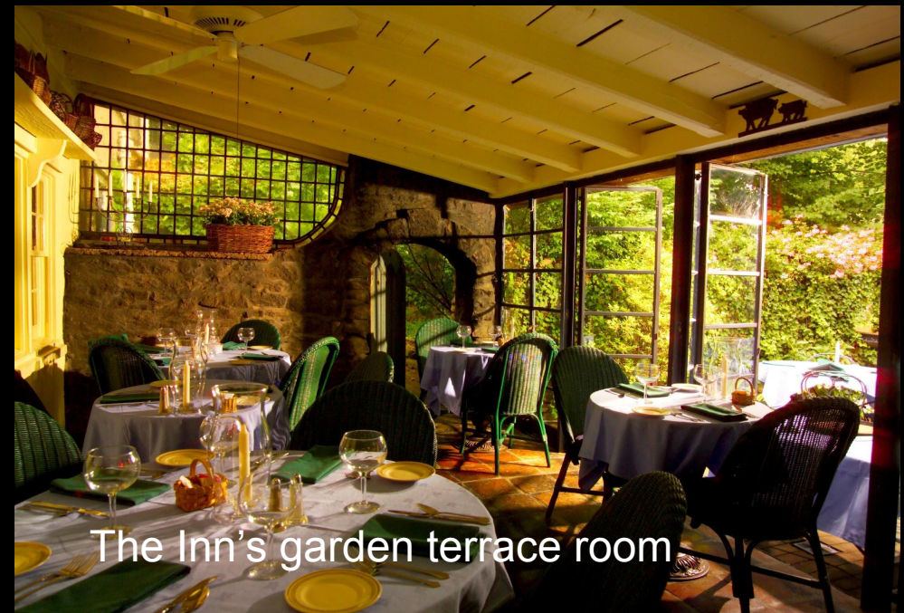
The Inn's garden terrace room